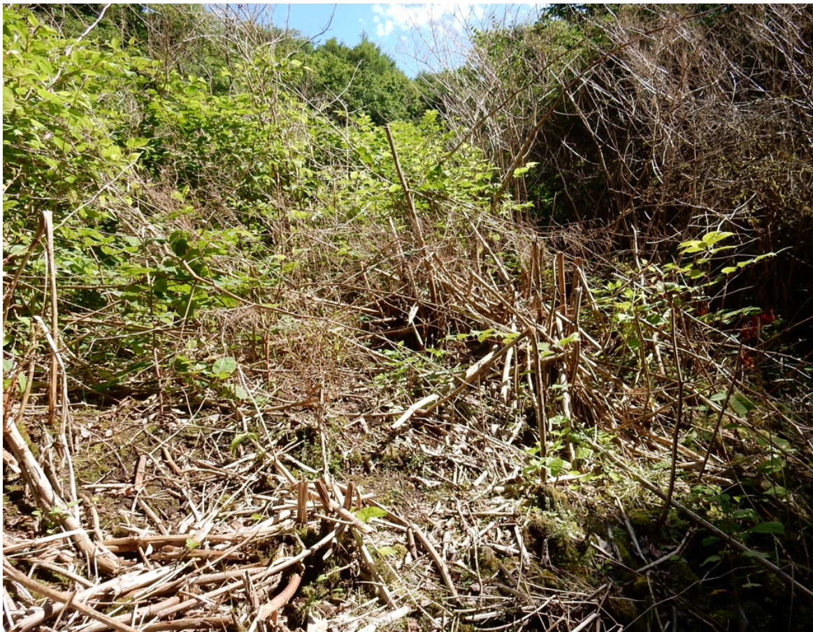
Photo taken Ilston Valley, Penmaen 10 July 2015. Dakar Pro has been sprayed over Japanese Knotweed since March 2015, but new shoots are emerging by July. This is due to resistance by gene amplification