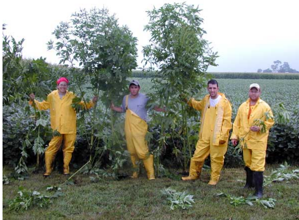
Northern Indiana. Giant Ragweed (3 m) resistant to glyphosate.

Introduction: Swansea is dubbed ' the Japanese Knotweed Capital of Europe '. Monsanto, whose factory was/is, 63 still in Newport, used Swansea as the testbed of its flagship herbicide, Roundup. Roundup was sprayed time and time again on Japanese Knotweed until it became a superweed, just like the weeds in the US, where they grow Roundup Ready crops.